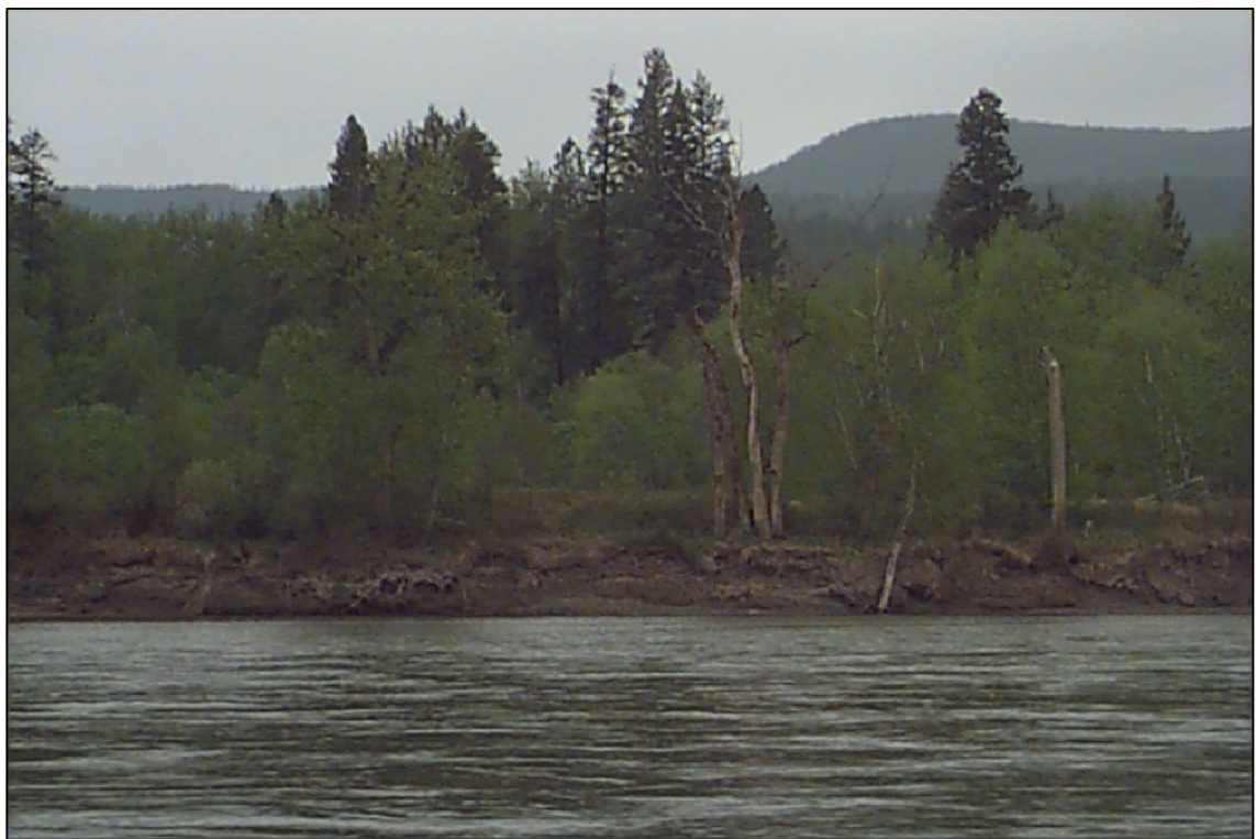
RIGHT BANK VIEW