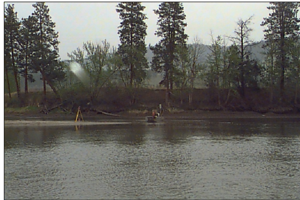
LEFT BANK VIEW